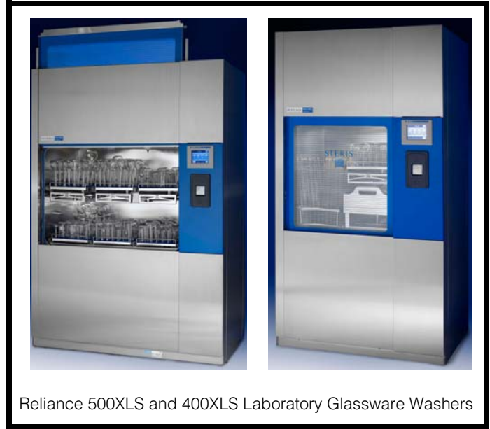
Reliance 500XLS and 400XLS Laboratory Glassware Washers

NOTE: When Effluent Heat Recovery option is selected, the drain valve and outlet are located outside of the washer. Refer to equipment drawings for more details.